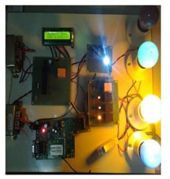
Fig.2.Setup of cost effective home automation system hardware

The Power-up Timer provides a fixed 72ms nominal time-out on power-up only From the POR. The Power-up Timer operates on an internal RC oscillator. The chip is kept in RESET as long as the PWRT is active. The PWRT's time delay allows VDD to rise to an acceptable level A configuration bit is provided to enable/ disable the PWRT. The power-up time delay will vary from chip to chip due to VDD, temperature and process variation. The Oscillator Start-up Timer (OST) provides 1024 oscillator cycles (from OSC1 input) delay after the PWRT delay is over (if enabled). This helps to ensure that the crystal oscillator or resonator hasstarted and stabilized. The OST time-out is invoked only for XT, LP and HS modes and only on Power-on Reset or wake-up from SLEEP.