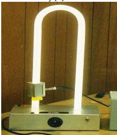
Fig. 1: Plasma Antenna

When voltage applied to an antenna, electric field is produced and this electric field causes current to flow in the antenna [3]. Due to current flow, magnetic field is then produced. These two fields are emitted from an antenna and propagate through space over very long distances. The applications of plasma antenna is in high speed digital communication and radar system, radio antenna, stealth for military application and can be used for transmission and modulation techniques (PM, AM, FM) [2]. The advantages of plasma antenna are in its high power, enhanced bandwidth, higher efficiency, lower thermal noise, perfect reflector, low in weight, smaller in size, and improved reliability [4].