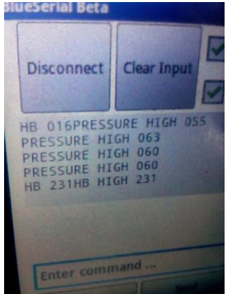
Fig. 5 Result after transmission

The measured data are sent to the remote system and displayed as shown in the Fig.5. The result as shown in the Fig.5 indicates whether the pressure is high or low by comparing with the threshold value that has been set. When the heart beat rate and blood pressure goes beyond the threshold value the buzzer gets switched ON. The obtained result can be displayed in the Hospital Information System after transmission and can be viewed by the doctor. The doctor then analyses the report and takes the necessary action. Also the doctor's feedback about the patient's health is sent to the remote system.