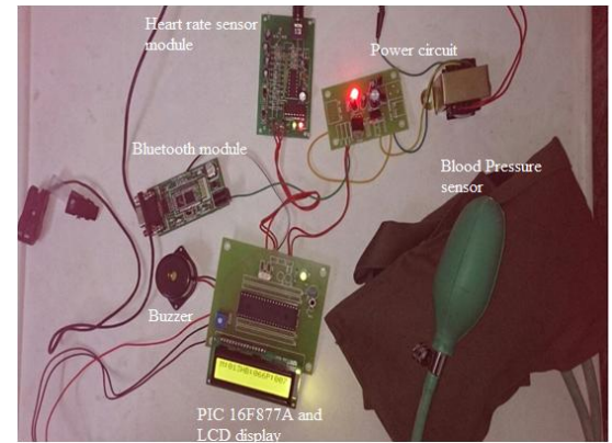
Fig.3 Image of project setup

The entire project set up is shown in the Fig.3.The heart rate and the blood pressure sensors are connected to the respective ports of the microcontroller as discussed earlier. The output from the sensors is transmitted via Bluetooth module which is also connected to the microcontroller.