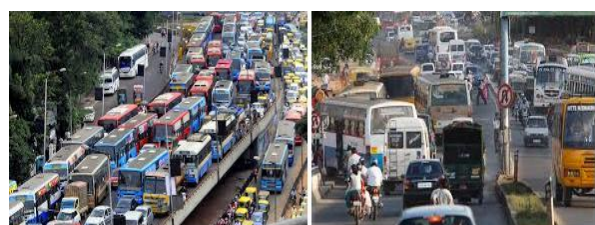
Fig 1: Traffic in Bangalore city

The resultant offshoot of such a high automobile growth is that now Bangalore is one of the most accident-prone cities in India. This can be overcome by RFID technology in this system moreover, the ambulances often get stuck at the traffic signals where all other vehicles try to squeeze in to all the available space so as to move ahead as soon as the signal turns green. Unlike western countries, Indian cities cannot think of having separate lanes for emergency purpose due to lack of road planning and infrastructure.